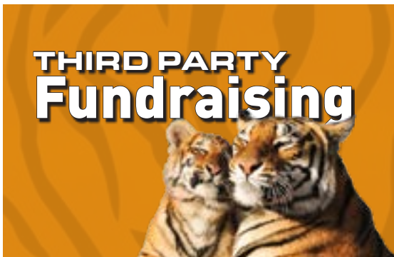
14 Events as Unique As You Are!