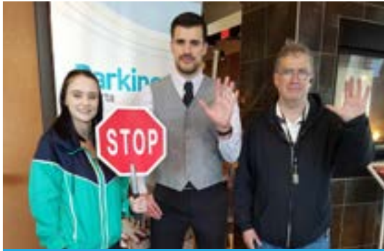
1 Parkinson's Awareness Month