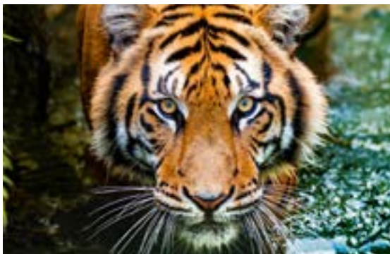
4 The Uniqueness of Parkinson's